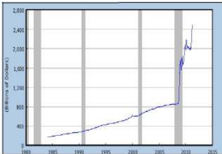
ADJUSTED MONETARY BASE-St.LOUIS FEDERAL RESERVE

Note the sharp jump in the monetary base starting with quantitative easing QE1 and followed by QE2. This increase in dollars floating around the economy here and in the rest of the world needs only the spark of increasing velocity of money exchange to trigger a major inflation period. Note the fact that the stock market has nearly doubled in the last two years is a direct consequence of this increase in available money. There is actually no increase in real wealth produced by this rise since it does not match the factor three increases in the monetary base. The stimulus money being injected here and abroad also accounts for the recent rapid increases in commodity prices for wheat to gasoline to metals such as copper, silver, and gold. The only thing which has been holding back an accelerated rate of inflation in the United States is decreasing home prices and high unemployment rates. Once these improve, major inflation rates are guaranteed to accelerate. Whether this inflation will be as bad or worse than the “not worth a continental” of revolutionary