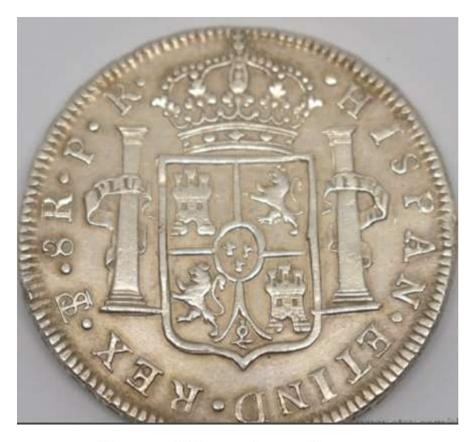
Potosi 8 reales silver

It is believed that the USA dollar sign came from its resemblance of the superimposed Potosi mint trademark. During the colonial period here in the US, Spanish real coins were readily accepted.