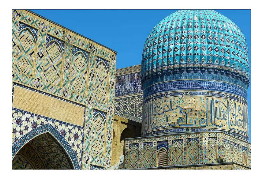
Bibi-Khanym Mosque, Samarkand, Uzbekistan

From Samarkand the Silk Road heads south-west to Persia passing close by Tehran. The Silk Road continues on to Bagdad in Iraq and finally west to the Mediterranean locations of Antioch and Tyre. The rest of the goods transport was done by sea reaching Constantinople, Venice and Rome.